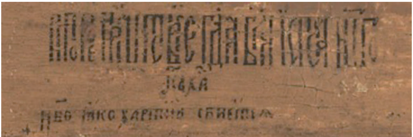
10 Inscription: The sky will be rolled as a scroll.