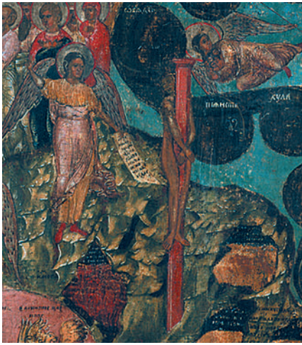
23 The Kindly Adulterer

that alcoholism is an illness and not a sin? In any case, this detail testifies to the age-old problem of drunkenness in Russian society. It was condemned by the Church in the peasantry and even more so among the merchant class, which patronized the construction of churches in the Volga region, where this icon originated.