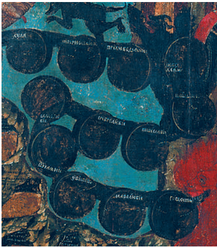
20 Detail of serpents "toll-houses"

Devils flit around the rings, presenting accusations both true and false, while angels attempt to protect the sinner. 30