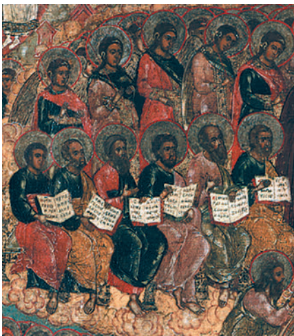
8 Apostles (seated) and elders

These elders represent the twelve apostles and the twelve tribes of Israel (although, generally, Last Judgment icons, including this icon, display only the apostles; this detail is usually referred to as "the apostolic tribunal").