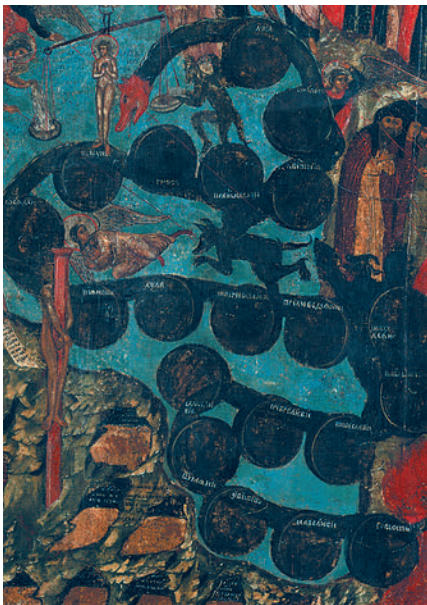
4 Serpent of Tribulations

This icon features a detailed depiction of the vision of the prophet Daniel; the four temporal kingdoms that will be replaced by the new spiritual world.