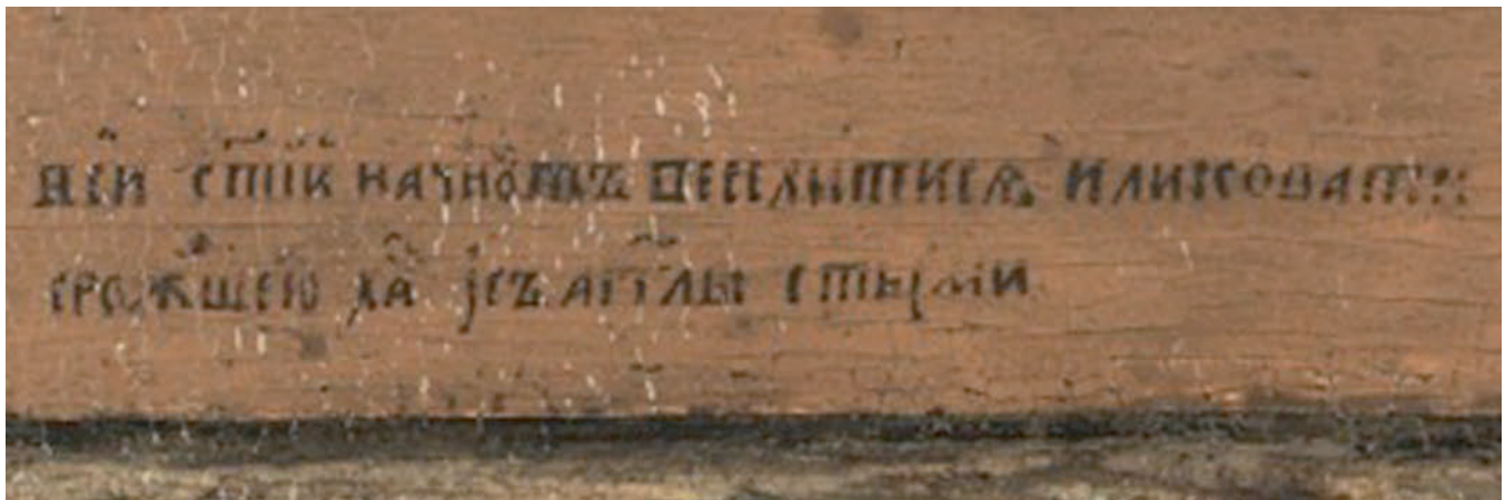
13 Inscription: All saints will rejoice and celebrate the birth of Christ along with the saintly angels