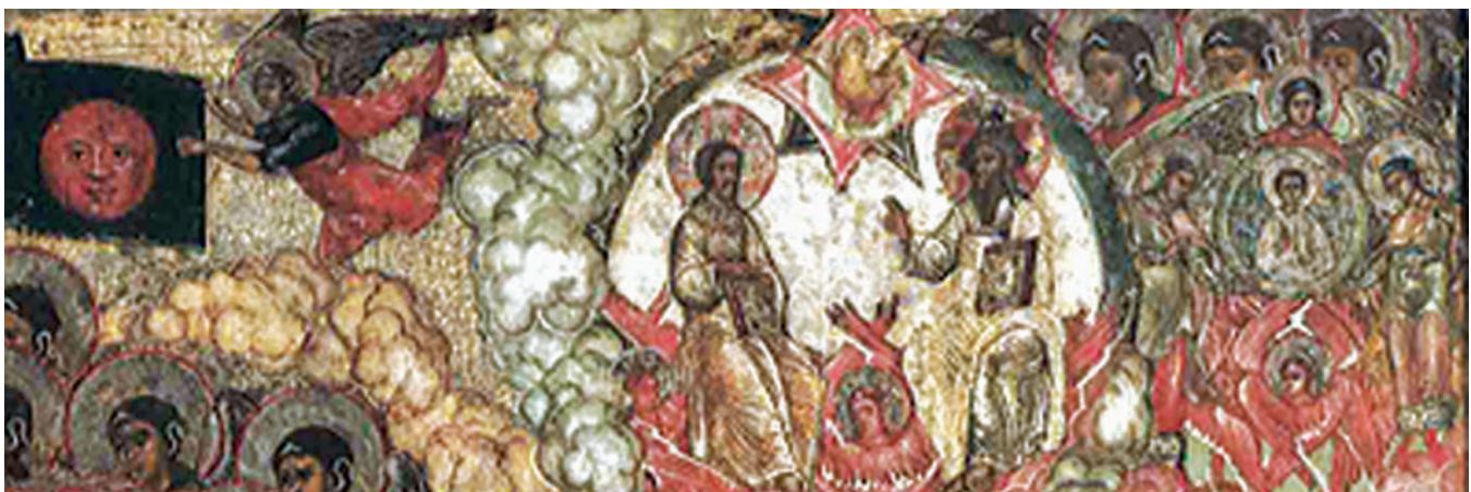
15 New Testament Trinity (center), with a gathering of angels (right)