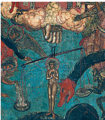
19 Hand of God with scale and youth

The naked youth symbolizing the individual undergoing the Last Judgment stands on one of the coils of the giant "Serpent of Tribulations," a required image in Last Judgment icons. From the mouth of the "apocalyptic beast," upon whom Satan is seated in Hell, the serpent rises up in heavy curves; its head comes very close to the figure of a naked man. To the serpent's body are attached a series of circles, on each of which is written the name of one of the potential sins with which the court may indict the deceased. These circles (Figure 20) represent the tribulations or "toll-houses," a series of gateways through which a soul must pass on its way to judgment. The sins are placed in order of increasing gravity, with the least serious located far from the mouth of the Hell and the more damning ones closest to Hell.