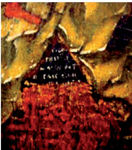
22 Facial features in a mass of red color

It is also interesting to compare the tortures listed above to those itemized in the Byzantine text The Word of Palladius of Mnichos about the Second Coming which is another basic source for most of the Last Judgment icons. According to Palladius Mnichos (c. 363-430?), torments are distributed as follows: "boiling pitch for drunkards, fire for fornicators, an inexhaustible worm for money-grubbing persons, gnashing of teeth for magicians, frost for the ungenerous, fear for thieves." These torments, with the exception of the gnashing of teeth which in the Word of Palladius is intended for magicians, correspond to those in this icon. 35