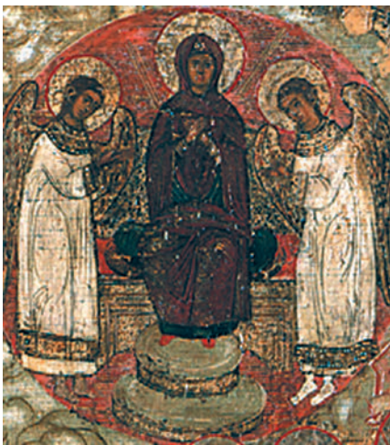
12 The Mother of God

The final triumph of the righteous in the Heavenly Kingdom, a standard element in depictions of the Last Judgment, including here, is described in Revelation 6:11, and in greater detail in Revelation 21. In 16th- and 17th-century Russian compositions, Heavenly Jerusalem is sometimes depicted by living quarters and feasts prepared for saints of different ranks, in accordance with their description in the Life of Vasily the New . 13