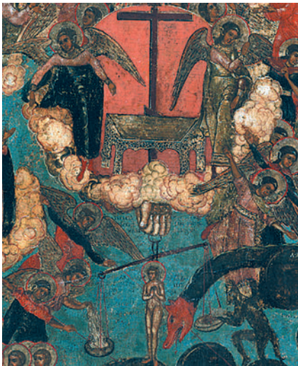
3 A human soul facing Last Judgment

Our intention is to analyze the images in this teeming icon, one after the other. We will begin with the thematic center of the composition, “Christ in Judgment of the World.” Here Christ is seated inside a round mandorla (a round or lozenge-shaped section in an icon) in the second tier from the top of the icon.