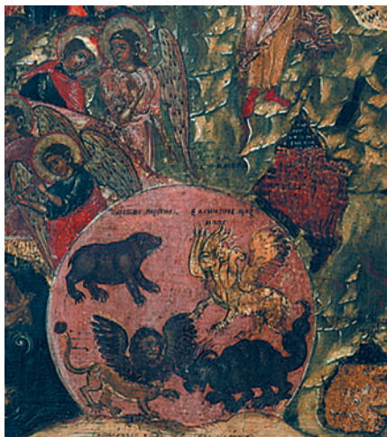
6 Prophet Daniel's vision of the four doomed kingdoms