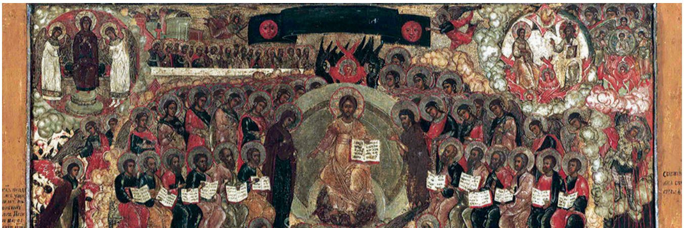
2 Detail of scroll and the Deesis tier

Below this banner are two crucial and central elements of this icon; the Deesis tier, in which Christ is flanked by the Mother of God and John the Baptist, who are asking Him to forgive sinners; and the Etimasia (or the "Throne Prepared"), a throne with the instruments of the Passion. Below this is a group of apostles judging the world alongside Christ; a circle of angels; and saints awaiting the Last Judgment.