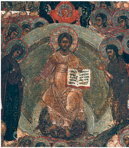
7 The Mother of God, Christ and John the Baptist

At the feet of the Mother of God and of John the Baptist stand Adam and Eve, the first inhabitants of the earth. According to biblical tradition, their souls were raised out of Hell by the Savior during His Descent into Hell, along with other righteous pre-Christian worthies.