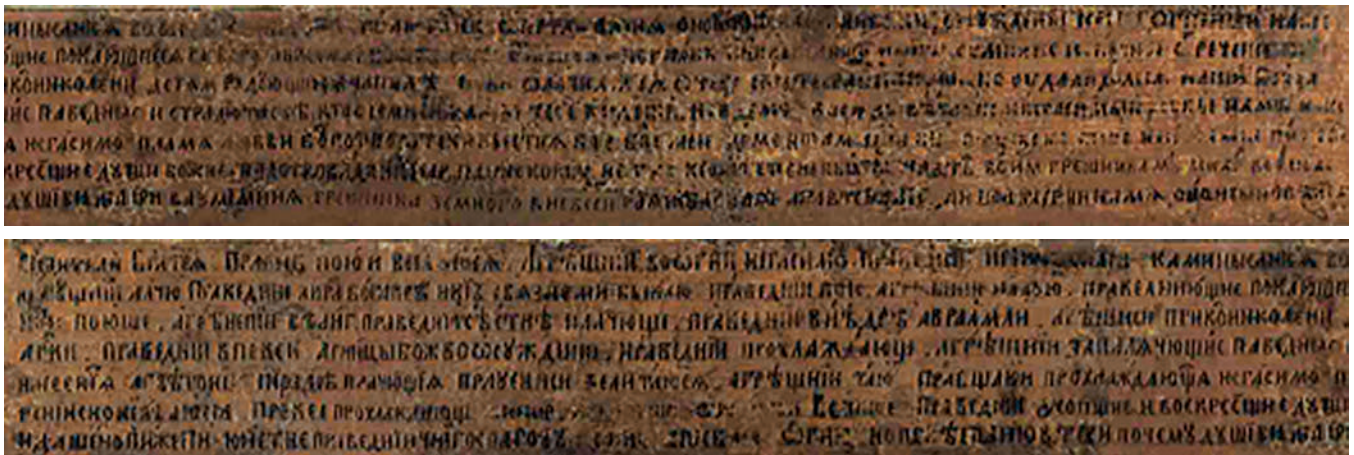
26 Text in lower margin: Upper cartouche is the left side, lower is the right.