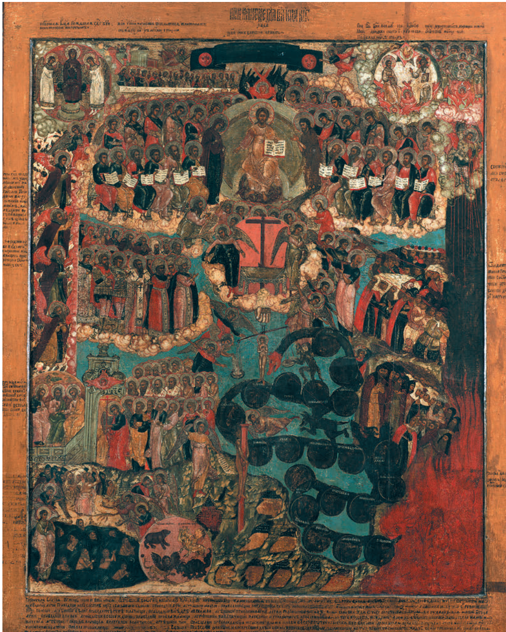
Figure 1 The Last Judgment