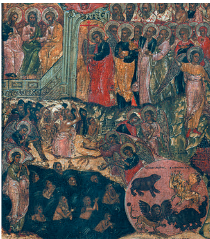
25 Prophet Daniel's vision of the four doomed kingdoms

In the lower right part of the composition, inside a pink circle (Figure 25), are the allegorical images of the four beasts who “came up from the sea,” symbolizing the four “doomed kingdoms” and illustrating the prophecy of Daniel, a standard item in Last Judgment icons (Dan. 7:3-8). The sea and the earth releasing the dead, as well as the four trumpeting angels from the scene of the resurrection of the dead, are themselves typically associated in the iconographic tradition with the four apocalyptic Angels “standing on the four corners of the earth, holding the four winds of the earth” (Rev. 7:1) and with the four heavenly winds fighting each other on the great sea (Dan. 7:2). 37 The inscription corresponding to the story reads: Angel Gospoden' pokazuyet Daniilu chetyre zveri (“The angel shows four animals to the prophet Daniel”).