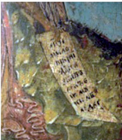
24 Penalty for the Kindly Adulterer

In an image unfamiliar to many Western viewers, next to the “Serpent of Tribulations,” exactly in the central axis of the icon, the “Kindly Adulterer” (also translated as the “Generous Fornicator”) is represented as a naked person tied to a pillar of shame (Figure 23). Such adulterers are the beneficiaries of an exception to the punishment usually meted out to sinners in their category: because they have been charitable during their lifetime, they are receiving a lighter sentence. Excused from the “eternal fire” penalty, they are now being held in a special place. To the left of the “Kindly Adulterer” is an angel bearing a scroll with an inscription which details the lighter penalty: the sinner depicted was a wealthy man who had relaxed sexual mores but was generous with his alms, so although he is deprived of Paradise, he is spared the tortures of Hell, and is thus shown placed between Hell and Paradise (Figure 24).