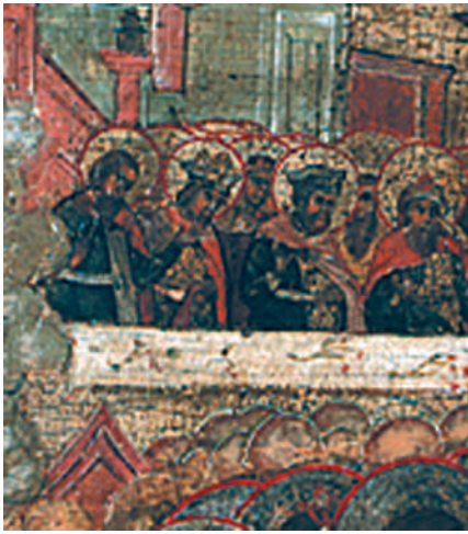
11 Heavenly feast

next to him two tsars and a warrior. In the background stands one of the virtuous wives, a frequent character in Orthodox tradition.