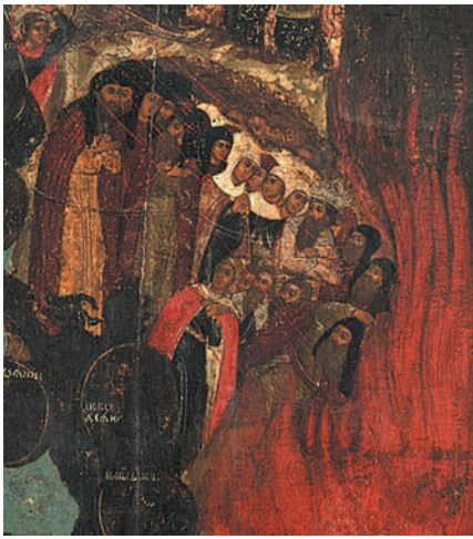
18 Unfaithful Russian Orthodox people

contains many husbands and wives: some are submerged up to their waists, others up to their chests, and still others up to their necks," depending on the degree of their guilt. 28