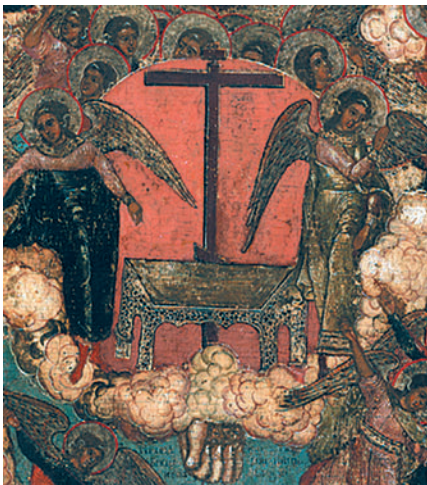
16 Trapezoidal table of the Throne Prepared

such by an 18th-century believer; the trapezoidal shape is the result of the “reverse perspective” typical of many early icons. If the trapezoid were reversed, with the shorter line above the longer, a 21st-century viewer would also perceive the table as square even though the actual shape is a trapezoid. This is the “Throne Prepared” (the Etimasia ) the symbol of God’s presence. The Etimasia , along with the depiction of the Cross, forms the compositional center of the icon. The Throne Prepared symbolizes all in one image Christ’s Golgotha, his Resurrection, and the Second Coming on the day of the Last Judgment. A story from the Apocrypha about how, after the ascent of Christ, the Apostles saved a special throne for Him upon which they placed the bread of the Eucharist, forms the basis of the tradition for such a representation. 25 The Etimasia , when used as an element of Last Judgment icons, also carries legal significance. Such an interpretation is recorded in historical church tradition; for example, during the Ecumenical Church Councils, the debates among bishops took place around a throne upon which was placed the Gospel. In the Last Judgment, the throne is not just the symbol of Christ in general, but specifically the symbol of Christ in his role as the Judge who has exclusive power over the world, according to the vision of John the Theologian, who saw that “...a throne was set in heaven, and one sat on that throne” (Rev. 4:2). 26