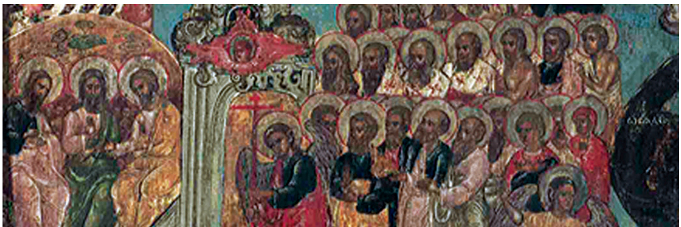
14 The Bosom of Abraham --Abraham, Isaac and Jacob--seated at the Edenic corridor