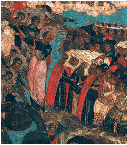
17 Moses and the outcast nations

given in most Last Judgment icons, tells how the Jews will try to justify themselves during the Last Judgment for their rejection of Christ. According to the scene from the Life of Vasily the New , the Jews will try to explain that they rejected Christ in order to remain faithful to the Law of Moses. Having seen him, the Jews recognize him at once and exclaim: "O, Moses, you gave us the Commandments. We will abide by this Law, given by you," to which Moses replies: "O, silly and callous in your heart are you, who are not the sons of Abraham but of the devil himself. Didn't I write in my Law to you thus: 'The Lord thy God will raise up unto thee a Prophet from the midst of thee, of thy brethren, like unto me; unto him ye shall hearken.'" 27 Moses thus refers to his own words in Deuteronomy 18:15, which in Orthodox exegetic tradition are interpreted as a sign of Christ's impending arrival. An inscription, probably corresponding to this story, is placed near the figure of Moses in the icon, but it is not entirely clear.